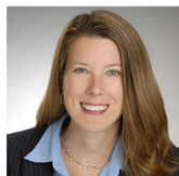
Sheri Bonstelle Land Use