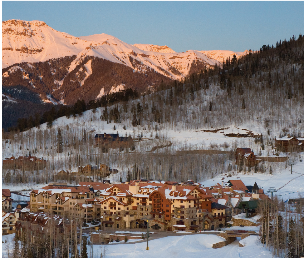
HOTEL MADELINE, TELLURIDE. Our hotel lawyers represented a European bank in maximizing recovery on a $156 million loan secured by a luxury hotel mixed-use property (with residential and retail) operated by a top luxury brand. Our strategies resulted in the lender taking possession of the hotel and other mixed-use assets, while avoiding liability under an SNDA and terminating the long-term hotel management agreement. Termination of the management agreement immediately added at least $41 million of value to the property.