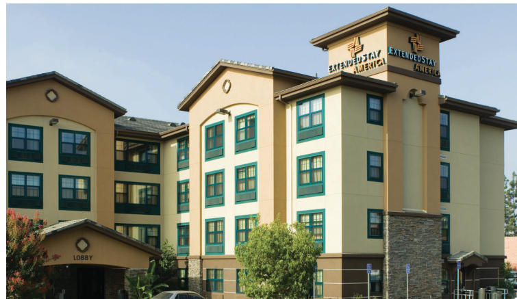
EXTENDED STAY AMERICA, SACRAMENTO. We have performed system-wide accessibility audits for Extended Stay America hotels (including prototype plan checking), and have assisted them nationally with proactive and defensive ADA and related accessibility compliance matters.

Being ADA-friendly is good business. Accessibility compliance is the law. And it is much cheaper to be proactive on accessibility issues than to defend lawsuits.