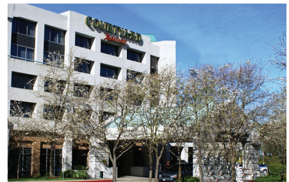
COURTYARD BY MARRIOTT, RICHMOND.