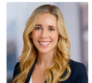
Lauren McKnight Real Estate