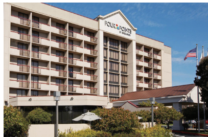
FOUR POINTS SHERATON, EMERYVILLE.